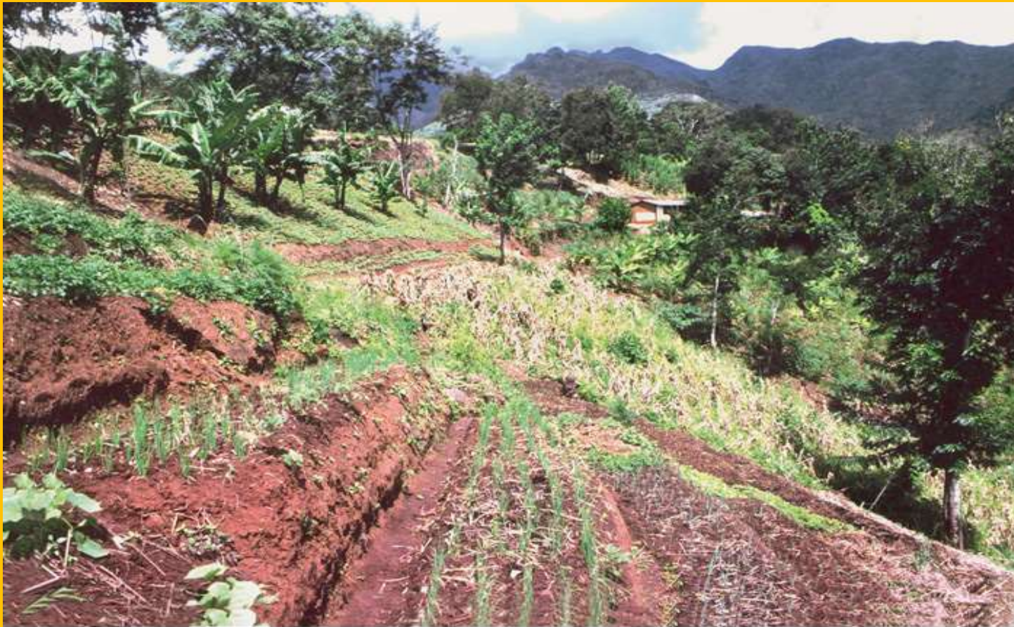
On their own initiative and with support from conservation projects, farmers in the Uluguru Mountains of Tanzania developed a diversified sustainable land use management system that combines terracing and agroforestry.